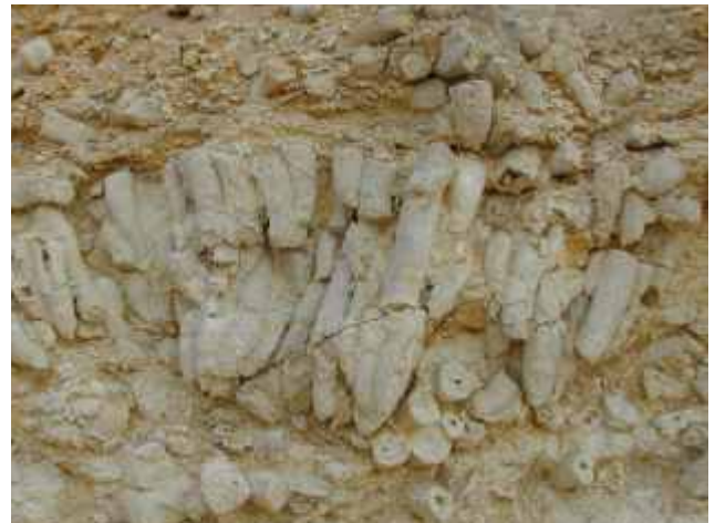
Figure. 3: Fossil shells, called Rudists, lived 80 million years ago and became extinct together with the dinosaurs. They occur in the Saiwan area (northern Huqf), showing that this area was once a tropical sea.