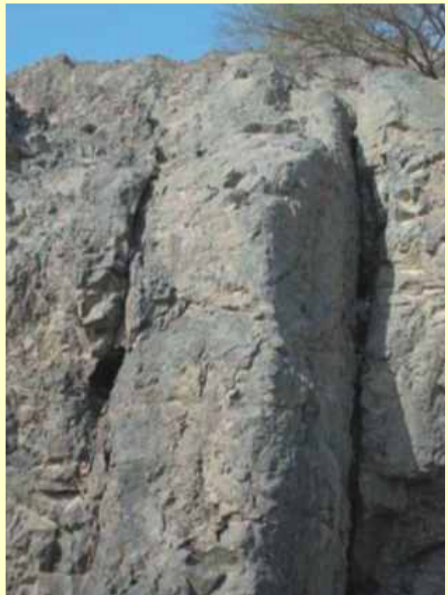
Figure. 2 : Sheeted dyke at Zabyat.