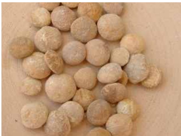
Figure. 2: Another example of ancient sea beds. Nummulites, coin-shaped creatures of ca. 1 cm wide, covered the sea floor some 40 million years ago. The sea retreated and the area became land (Sultan Qaboos University area, Al Khod). These rocks occur also in Egypt, where they were used to build the pyramids.