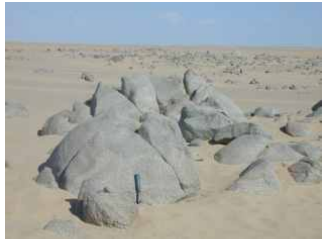
Figure. 1: The oldest rocks found in Oman: granite basement of at least 800 million years old, Al Jobah (Huqf area, Oman).