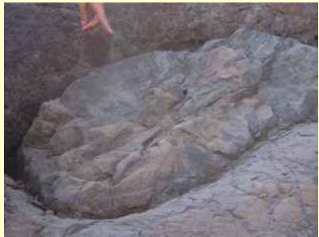
Figure. 1: A close-up on a pillow lava, notice chilled margin with radial fractures.