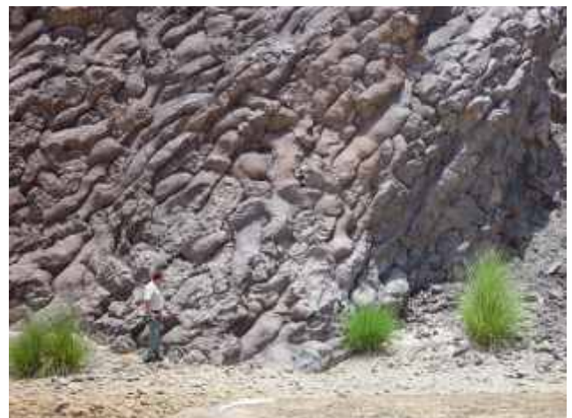
Figure. 4: The most beautiful 'Pillow lavas' in the world can be seen in Wadi Jizzi (near Sohar). They represent deep-sea volcanic eruptions.