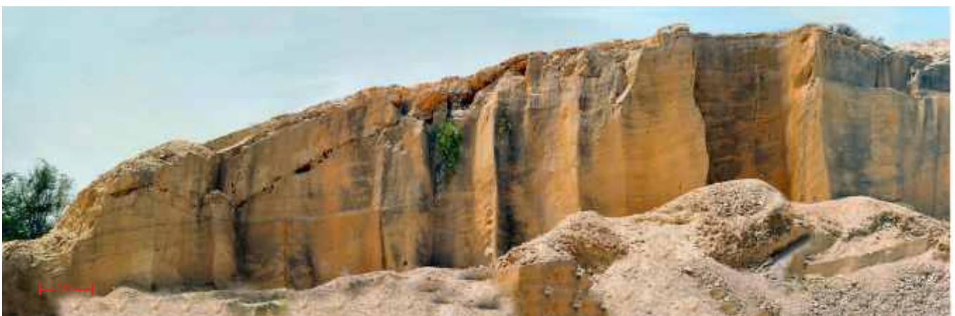
Figure. 1: Outcrop of Pleistocene cemented aeolianites ('fossil sand dunes'), Ras al-Hamra road (above the driving range) in PDO camp. Kilometer 21.5 from origin: Coordinates 23037'13.75"N, 58031'13.2"E. View is to the north-northwest.

In an endeavour to tie-in all available information and make the Muscat geological story as inclusive as possible, each outcrop will (where possible) be rendered as a photomontage, rather than single photo (Figure.1); complete with GPS coordinates, measured section, locale maps and sketches, occurrence in the stratigraphic column (Figure. 2), photogeologic interpretation and explanatory text (as noted in this partial example):